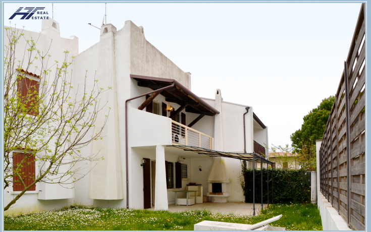
back facade from private garden

Terraced summer house close to Caorle - 2130_46-1