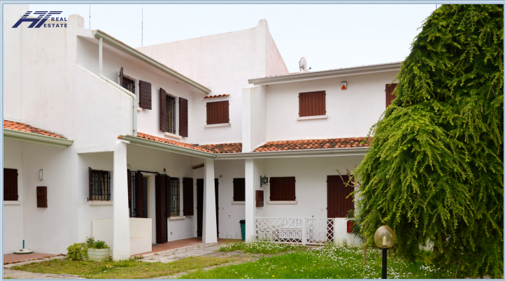
front facade from private garder