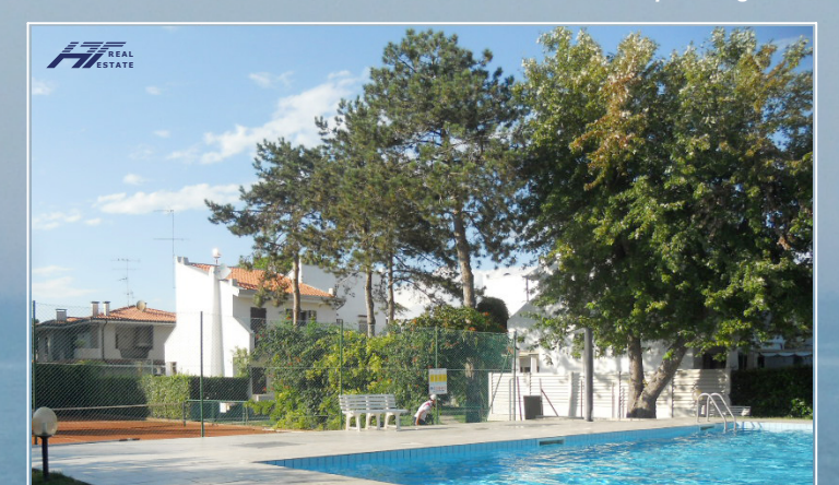
residential units from swimming pool